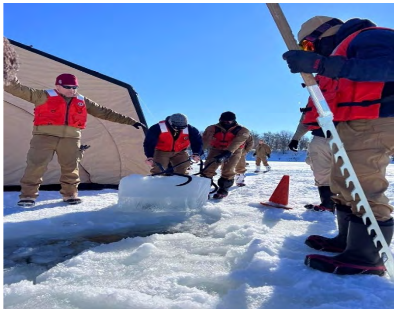
Team prepares ice for cold water diving