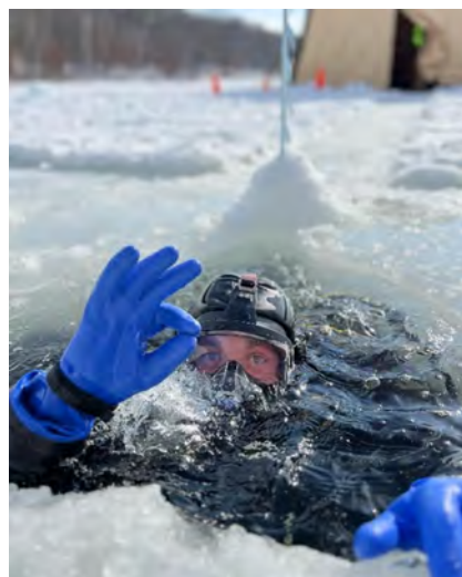
Diver tests out the cold Minnesota water

Brr!!!!. It was really cold in Minnesota in early February with temperatures in the teens and twenties, but divers from the Coast Guard, Navy and Army were prepared for the challenge.