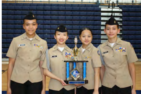
Harding Color Guard team earned third place

We knew that this was a rebuilding year for the Knight Navy, with only one senior cadet having ever participated in the regional meet when she was a freshman, but we also knew we had to start somewhere, and witnessing the level of competition we would face each year at this meet was a good place to start. All of the other area units were allowed to travel and compete in the regional drill meet last year, but the district denied us permission to travel due to lingering COVID restrictions in place.