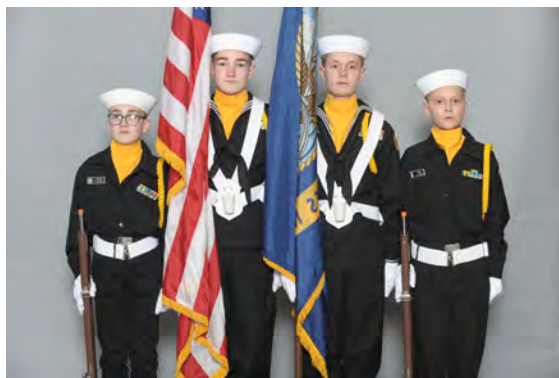
Polaris and TS Trident Color Guide