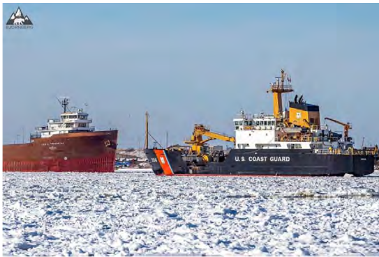
First one out of the gate for the 2023 shipping season is the classic laker Lee A Tregurtha (1942). From Fraser shipyard to the canal she was assisted by Gtugs Missouri and Kentucky and U.S. Coast Guard Cutter Spar.