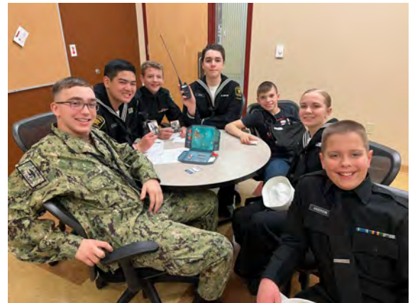
How fun is basic radio communication, when playing Battleship

In closing, the Twin Cities Squadron wishes to thank the Minnesota Council for the continued support and dedication to the USNSCC mission. We are looking ahead to busy spring and can't wait to see what other supported units are doing. Check out our Facebook page for more NSCC Twin Cities Squadron content.