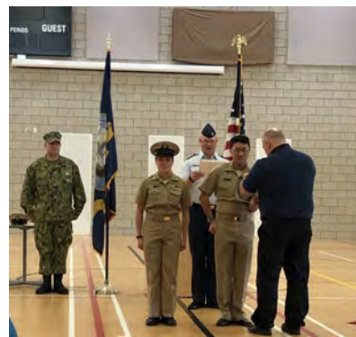
Polaris January Award Ceremony