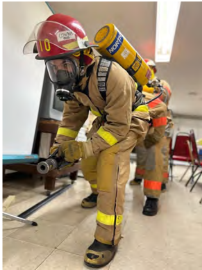
Simulated fire drills in full gear

Twin Ports Division has been hard at work conducting medical work ups for Grandma's Marathon which will be held June 17. We have also been conducting Damage Control Training and getting our sailors familiar with our Damage Control gear to include our Fire Fighting Ensembles and Self Contained Breathing Apparatus.