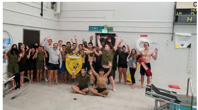
Como Cadets receive swim lessons courtesy of Abby's Hope

52 MCJROTC cadets traveled on a 3-day field trip under cold winter conditions to many different sites and activities in late February to build leadership skills, courage and teamwork. The cadets traveled to Fort Snelling State Park, listened to DNR talks, ate Meals Ready to Eat (MRE), visited the Minnesota State Capitol, conducted Winter Skills Training, Night Ski Lessons, Bon Fires, Lake