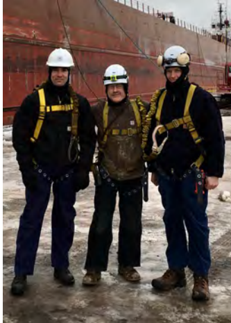
Preparing to go aloft

MSU Duluth has been giving back to the community this winter by volunteering at the CHUM Shelter. The CHUM shelter reached out looking for volunteers to help with their renovation project. Our unit jumped on this opportunity to give back to the community. Volunteers from our unit, as well as Station Duluth, helped CHUM move furniture, repair holes, paint walls, and clean bedrooms as well as common areas. If anyone reading this article is looking for volunteers for projects that benefit the community, you can always reach out to our unit for assistance at 218-725-3818. Operations must come first but if there is time, we love to give back to our community.