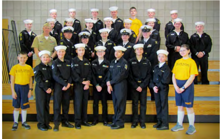
Polaris Battalion and TS Trident

Meanwhile, the TS Trident has been learning drill and ceremony, safety, and culinary skills. Using a model scale of powerlines, the leaguers were educated about arc flashes and the dangers of electricity. TS Trident was also taught firearm safety, how to tear down and reassembling the firearm, perform function checks, and then they used a laser program to practice their marksmanship.