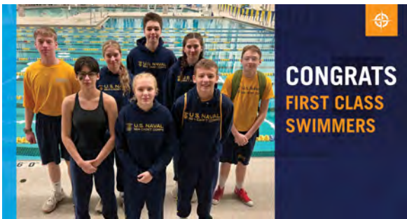
TCS first class swimmers qualify at Lifetime Fitness

February drill saw the unit return to Lifetime Fitness in Plymouth, Minn. to complete our annual swim qualifications. What a difference a year makes. The cadets were on a mission to best their qualification ratings from 2022, and they certainly exceeded all expectations. The TCS qualified nine first class, 13 second and three third class swimmers. The swim test consisted of a series of different events including a jetty jump, trouser inflation and float, prone float, back float, deep water treading, and 4 progressively longer swims. Those that qualified as first class also completed a 25m underwater swim with an oil maneuver. Thank you to Lifetime Fitness for your continued partnership and support of the USNSCC.