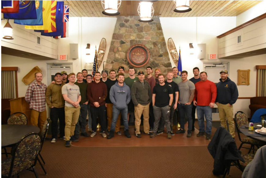
Divers from all military services enjoyed a dinner hosted by the Navy League at the classes completion at Camp Ripley

The Minnesota Navy League Chapter, a 501c3 is a non-profit registered with the State of Minnesota.