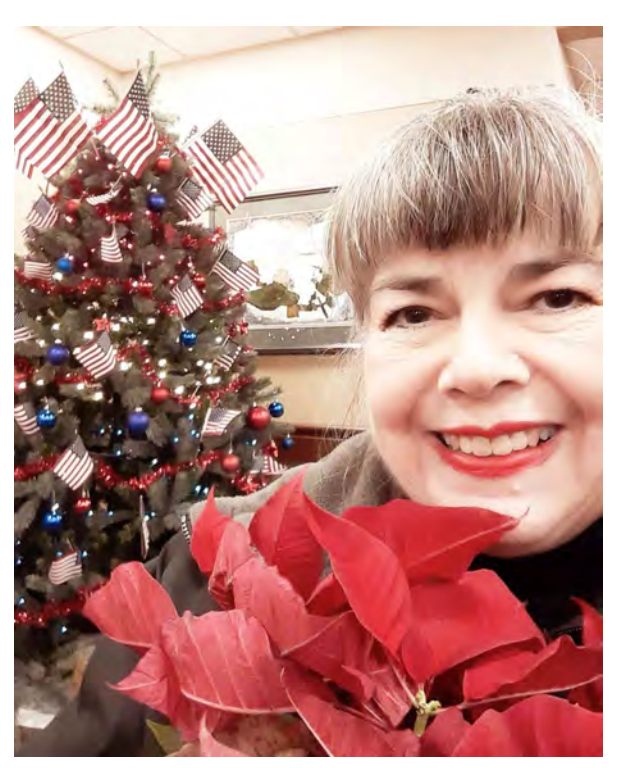
Delivering Poinsettias to Veterans Home in Fergus Falls

Upcoming Parades include the St. Paul Winter Carnival King Boreas Grande Day Parade January 27th at 2:00 pm and the Vulcan Victory Torchlight Parade February 3rd at 5:00 pm.