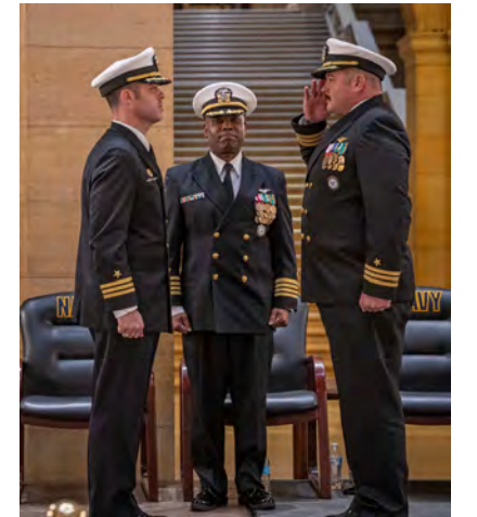
Navy League, as well as other Navy and military support organizations, to keep recommending Naval service and engaging with key centers of influence to explain the benefits and honor that comes with service in the Navy.

We rely on the continued support and dedication from the