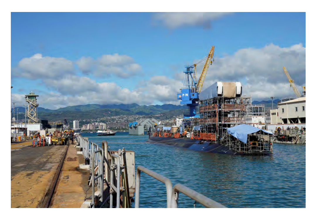
USS Minnesota (SSN 783) undocks at Pearl Harbor Naval Shipyard

The tenacity of the crew and the shipyard resulted in MINNESOTA achieving this milestone two weeks ahead of schedule. Once waterborne, the crew was able to move back onboard reviving the heart and soul of the submarine.