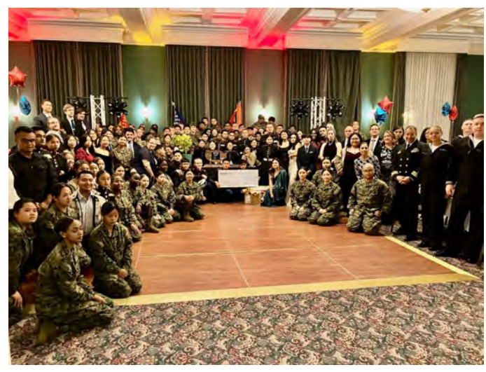
USS Minneapolis Saint Paul crew attended the Como Marine Corps JROTC Marine Birthday Ball at Herbies on the Park

Most recently, and in closing of the fourth quarter, USS Minneapolis-Saint Paul held their annual holiday party for the crew. This was their final gathering prior to entering a well-deserved leave period, commonly referred to as Holiday Standdown. Holiday Standdown is a period where the crew divides a block of time to enjoy time with family and vacation prior to returning to an increased operational tempo.