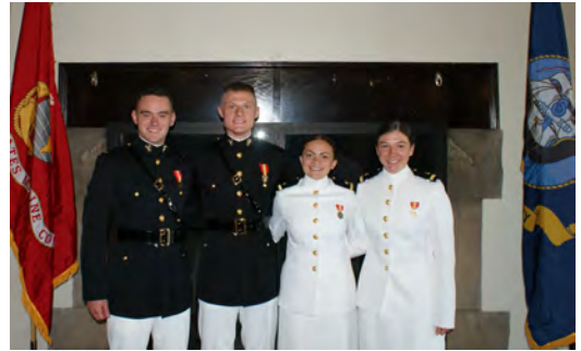
Newest Navy Ensigns and Marine Corps 2nd Lieutenants from the University of Minnesota