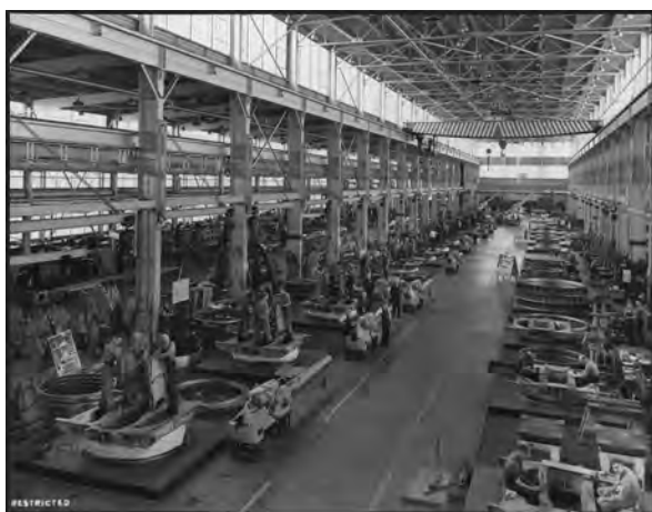
Forgotten Star Brewery once produced guns for Navy Ships

But did you know that the building which now houses the brewery was once the location of one of the most efficient naval guns manufacturers of WWII? The Northern Pump Company started out in 1929 manufacturing high pressure heavy duty positive displacement rotary gear pumps that were used for firefighting. The company produced pumps in that building through 1941, until the attack on Pearl Harbor occurred. After the U.S. entry into WWII, the plant was able to completely change from manufacturing pumps to manufacturing guns for Navy ships and was called Northern Ordnance.