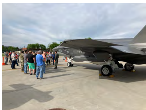
Participants were able to tour F-35C jets and talk with the pilots

The NROTC unit arranged with VX-9/VX-9 Det to have four Navy Fighter jets at the Minneapolis St. Paul Joint Air Reserve Station. VX-9 F/A 18 E/F Superhornet, an EA-18G Growler, and two F35C fighter jets arrived at the Joint Air Reserve Station on May 31.