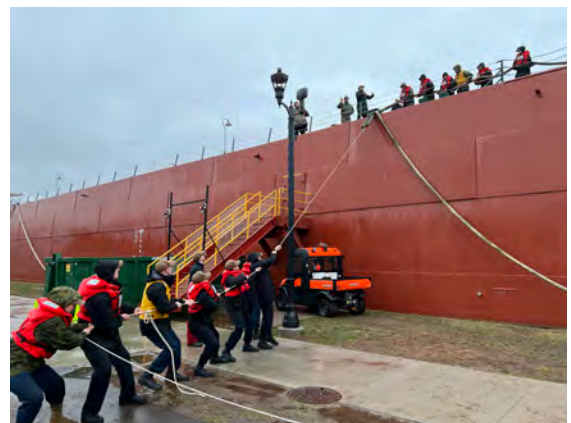
Midshipman participate in training aboard SS William I Irvin in Duluth