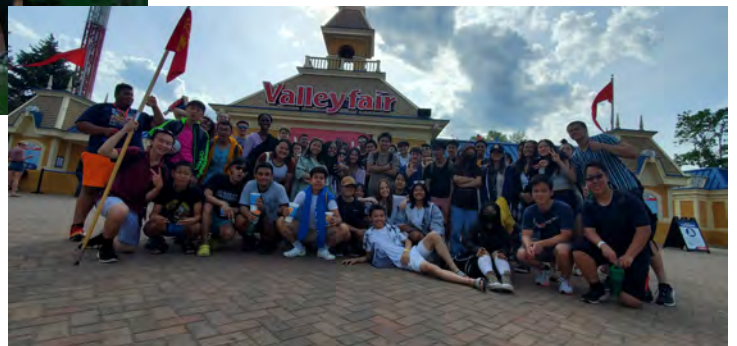
Several JROTC cadets/students closed out SY21-22 at Valley Fair Amusement Park.