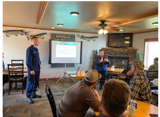
MSU Duluth presentation to Lake of the Woods mariners

Our office would like to remind folks reading this newsletter to always wear a lifejacket and have a float plan prior to getting underway in your boat. You can find more information on safe boating practices at www.paddlesafetwinports.org/safety.php