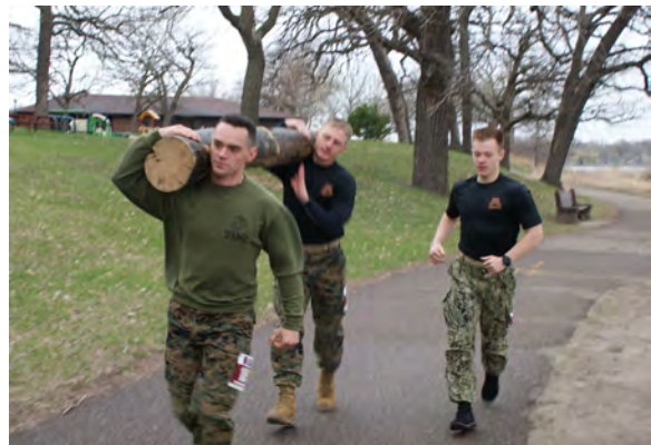
Eagle and Anchor 5K run