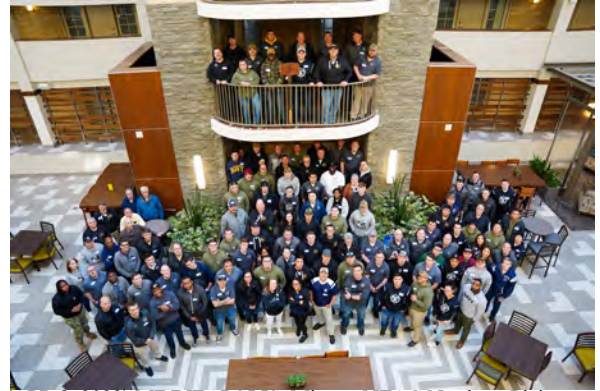
(APR 8, 2022) MINNEAPOLIS, Minn. – NTAG Northern Plains command personnel pose for picture at their command wide training.

We are doing our best to get out and about amongst our communities and take advantage of the summer weather, while also working hard in our recruiting stations focused on our mission of manning the fleet. While the entire recruiting enterprise across all services has been experiencing tremendous challenges, I am confident in our Northern Plains sailors and hopeful that our level of effort towards spreading Navy education and career opportunities will make a lasting impact in the great state of Minnesota and beyond.