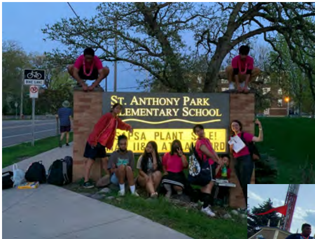
Cadets participate in a plant sale at St. Anthony Park Elementary School.

Additionally, weekly physical fitness weekly remains a critical part of the Como MCJROTC curriculum and allows each and every cadet the ability to do the best that they can with the body they have.