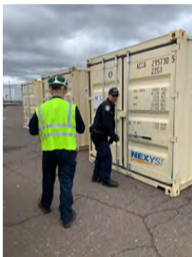
MST2 Davis inspecting Container

Our container inspectors recently conducted the first container inspections done by MSU Duluth. Our container inspectors work diligently to ensure that there is no structural damage to the container as well as checking paperwork to ensure that it matches the contents in the container and the container is the appropriate type.