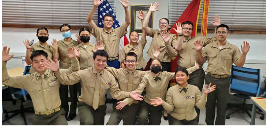
SY 2022-2023 Staff

Several JROTC cadets/students closed out SY21-22 at Valley Fair Amusement Park. A beautiful sunny day in the park was just the sendoff needed amongst good friends. Semper fidelis.