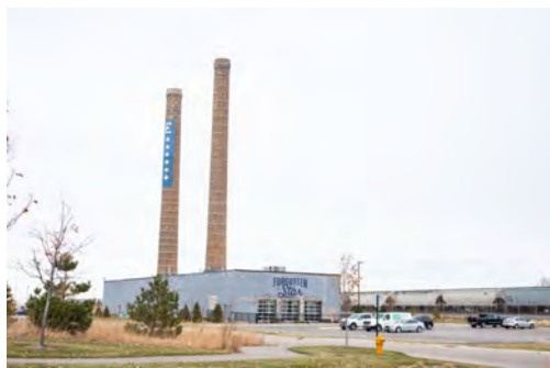
Forgotten Star Brewing Co. opening at the former Northern Pump Company in Fridley Note the six Star Awards on the North Stack.

Today the brewery sits in what was once the boiler room for the massive manufacturing facility that produced guns for the United States Navy and the ships that won the war. And now you know.