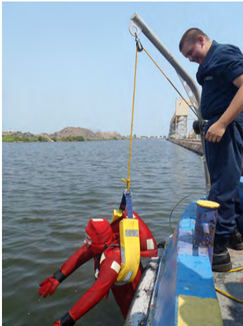
Enginemen in Twin Ports conducting survival suit qualifications