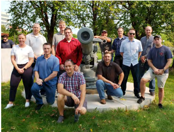
Chief Petty Officer Selectees at the USS Ward memorial

NOSC Minneapolis recently hosted an in-person Deployment Readiness Training (DRT) in August for Reserve Sailors and their families to ensure they are connected to local resources before, during, and after deployments. A variety of topics were discussed ranging from health care, education/training opportunities, and to financial and legal benefits. These resources help to prepare and guide attendees through the hardships of deployment, then enable them to successfully reintegrate back into their families, communities and careers.