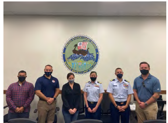
Senate Staff visit to MSU Duluth

The highlighted operation within MSU Duluth's AOR this past summer, involved an increased Coast Guard presence from Station Duluth up at the Lake of the Woods in early August. This operation resulted in one rescue and several violations of illegal passenger vessel operations which have ongoing investigations.