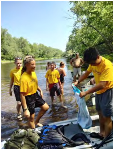
Polaris Battalion Rum River Adventure