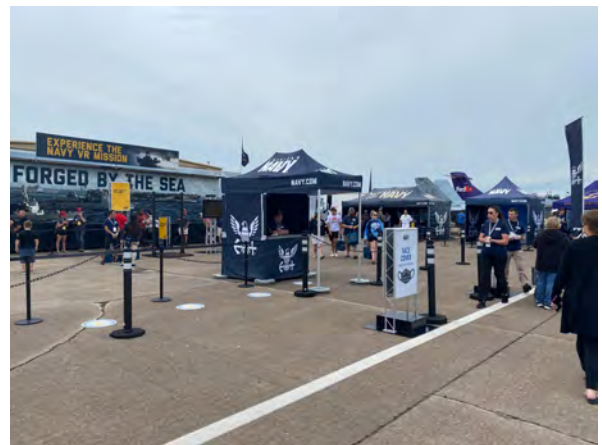
NTAG at Duluth Air Show