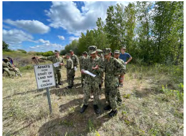
Land Nav at AHATS

TCS participated on 9/11 memorial Dedication in Wayzata August meant a return to drill at the Arden Hills Army Training Site (AHATS). The weekend was packed with hands on training evolutions including land navigation, rifle drill and tactical room clearing. While no airmen were lost, we did have a few teams do some extra exploring downrange while attempting to locate a waypoint. The rifle drill and ceremonies focused the cadets on individual performance, but also working together to achieve team precision. The highlight of the weekend was certainly the room clearing evolution. The adrenaline was on high as cadets got into the stack, breached a doorway and cleared a room of opposing forces. Hooyah!