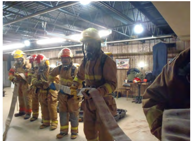
Members of Twin Ports Division conducting a damage control drill during their fire Party Training