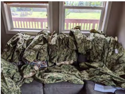
Winter Parkas have arrived!!!!!!

Polaris Battalion and TS Trident have an exciting drill scheduled for October with a camp out. Additionally, cadets are being issued their parkas this drill (the ones I have purchased so far). The October camp out will have the cadets setting up a base and then doing some culinary, field ops, marksmanship and other things.