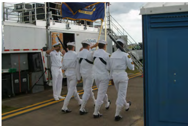
Twin Ports Division Posts colors for the Duluth Air Show