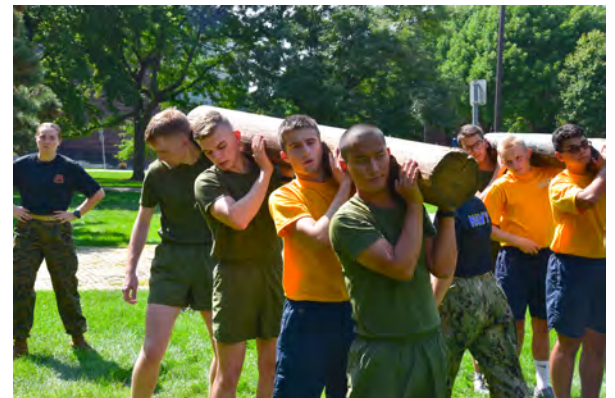
New Student Orientation physical training with midshipmen from University of Minnesota and St. Thomas.

During welcome week for the University of Minnesota and St. Thomas, the battalion hosted New Student Orientation for the incoming class of 2025. The battalion welcomed 12 new fourth-class midshipmen to the battalion after a full week of physical training, drill, and classes. With the semester now underway, we are incredibly proud of the rapid growth we have seen in the freshman class so far and we are excited to see the impact they will make on the battalion during the next four years.