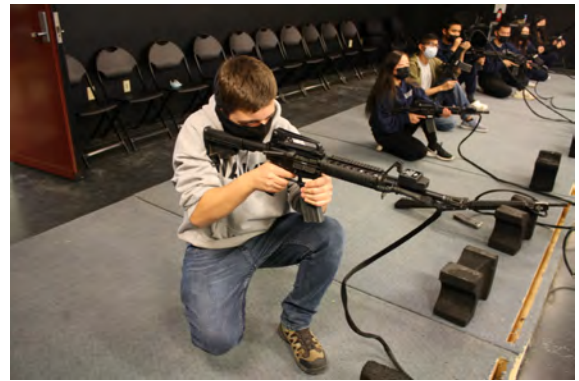
Firing weapons at Arden Hills

On Friday, January 21, the "Knight Navy" - Harding High School's Naval Junior ROTC unit, took 40 cadets to the Army National Guard's Armory and Training Facility in Arden Hills. After receiving a presentation, the cadets were introduced to various equipment and weapons and were given the opportunity to "fire" weapons on the virtual small arms range. The National Guard treated the cadets to a catered lunch from Subway. Without Navy vessels in the vicinity, reserve and guard facilities such as this are one of the few military orientation trips available to the cadets.