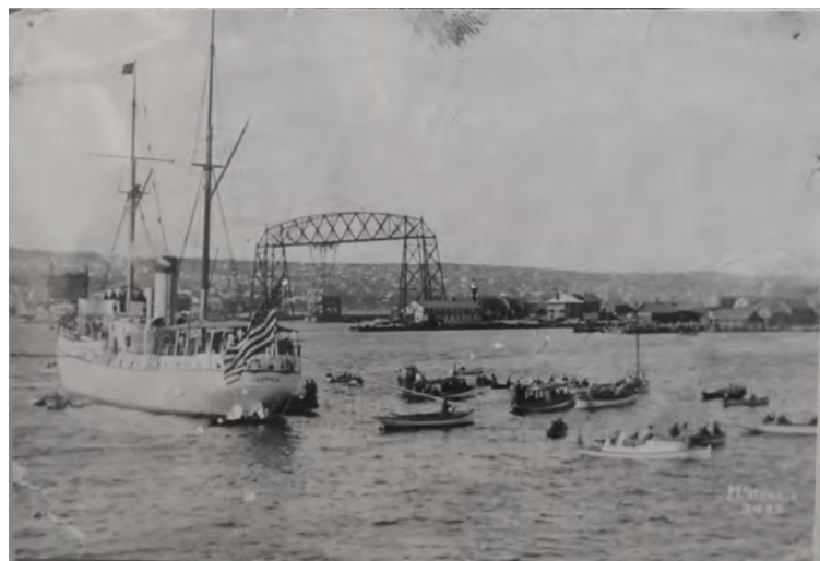
USS Gopher by lift bridge in Duluth

In 1921 the USS Gopher was transferred to the Atlantic Fleet and in 1922 USS Paducah (IX-23 ex PG-18) arrived in Duluth as the Naval Militia's training ship. They would train during regular two-week cruises and conduct gunnery exercises on Lake Michigan. She was later transferred to the Atlantic Fleet in 1941.