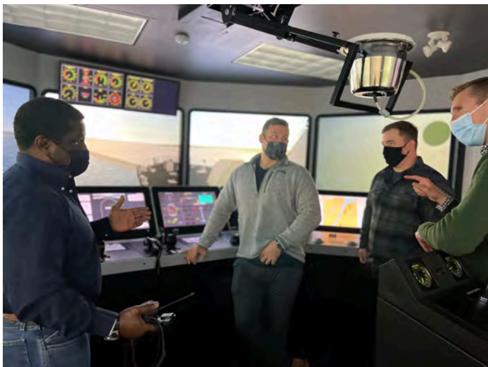
Crew training in Quebec City simulators for transiting locks and canals on the St. Lawrence Seaway

Thank you and we look forward to an historic event!