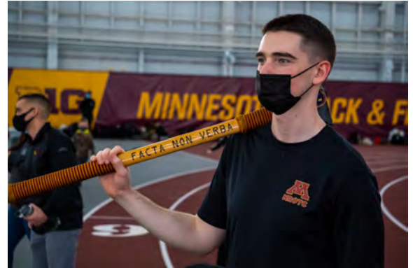
Midshipmen compete in JMAC