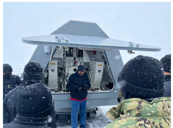
Brrr!!! It sure is cold here compared to Florida.