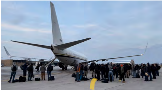
Minneapolis Saint Paul Crew members arrive in Escanaba