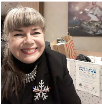
St. Paul Winter Carnival Clothing donation