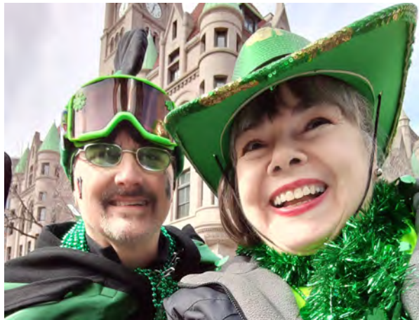
St. Patrick's Day Parade with St. Paul Winter Carnival Vulcan King

Finally, Outreach North is producing the "African American Submarine Experience" Documentary and is responsible for the filming, editing and distribution of this film.