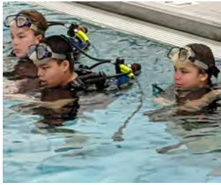
Cadets learn basic SCUBA techniques

Some day many of these cadets will decide to whether become SCUBA Divers and view the amazing underwater world. Cadets open up so many doors for the youth, this is just one more world to view