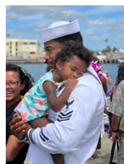
Various photos of the USS Minnesota Crew Arriving in Pearl Harbor.