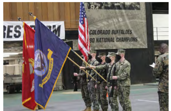
Color Guard at Colorado Drill Meet

After Colorado and spring break, the Battalion will return to campus just in time for the annual Joint Service Review (JSR) held March 19th at 11am. The University of Minnesota Army ROTC (AROTC) and Air Force ROTC (AFROTC) Battalions will join the Midshipmen at St Thomas Academy to show off their colors and be awarded for their hard work during the 2021-2022 academic year. Family and friends of the Battalion are invited and can also watch on Facebook live stream. Happy Spring from the University of Minnesota NROTC Battalion!