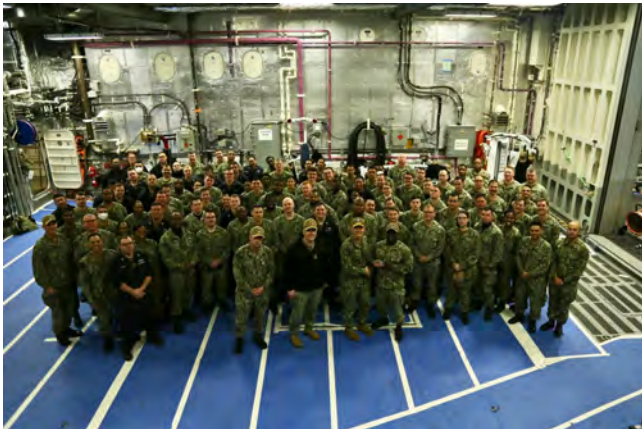
Minneapolis Saint Paul Crew with VIP visitors

The coming weeks are sure to be even more eventful as the crew officially moves aboard and continues to carry out the inspections and certifications across each department that are necessary to bring the ship to life.