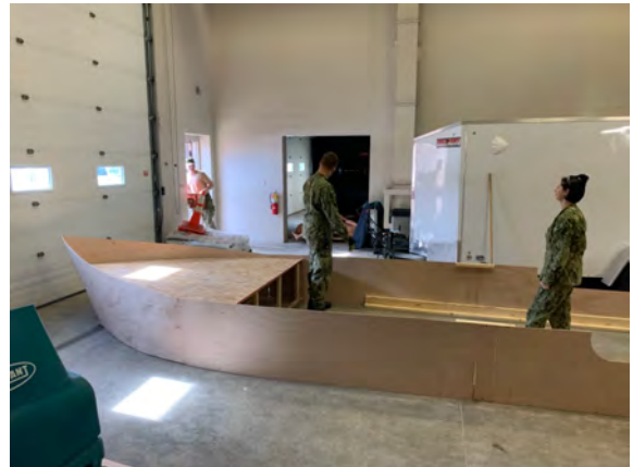
Cadets build parade float of Arleigh Burke Destroyer

The Battalion is in the process of building a parade float size Arleigh Burke Class Destroyer. This boat will be easily assembled and disassembled to put on a trailer bed for use as a float in parades this summer. The cadets are using power tools, bending wood to form a hull, and following blueprints. The cadets will add a gun to shoot smoke out. This requires some STEM opportunities. We are looking forward to a fun parade season this year.