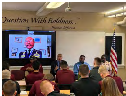
Speakers addressing University of Minnesota Midshipmen

The experiences of this unique cadre of African Americans speakers have paved the way toward a more inclusive submarine force and inclusive Navy. The wealth of experience and the "first" these men and woman experienced paved the way for others to follow in their footsteps.