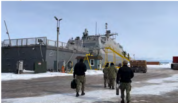
Crew members move aboard the ship in Escanaba.

By PCU Minneapolis Saint-Paul Public Affairs