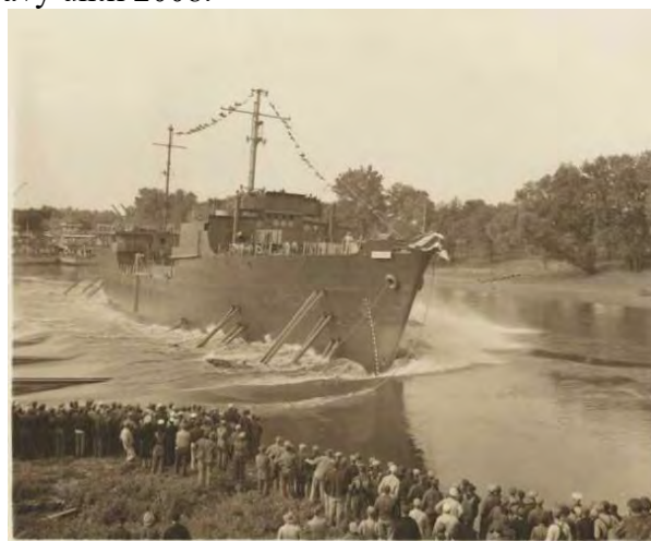
Launching of the Genesee at Port Cargill in September 1943