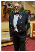
EMCM (SS) Early Vincent