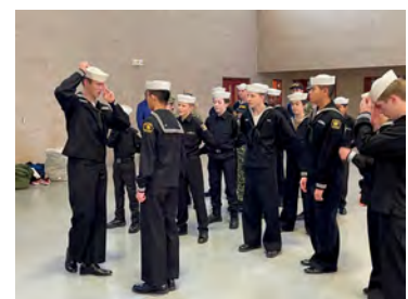
Service Dress Blue Review