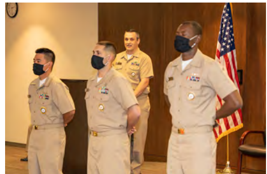
NTAG Chief Pinning Ceremony

4/5 June 2022 - Eau Claire, WI - Chippewa Valley Air Show Blue Angels