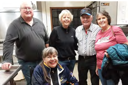
Preparing Thanksgiving Dinner at Peterson Trip American Legion in Ashby