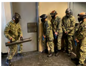
Breaching with MSP Airport SWAT