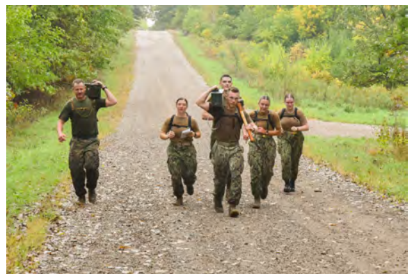
Fall Training Exercise at Arden Hill Army Training Site.

In October, the senior Navy-Option midshipmen received their coveted service assignments. We are glad to report that once again, all received their first choice. Of the class of seven scheduled to graduate in May of 2022, two will be commissioned as Second Lieutenants in the Marine Corps, one was selected for Surface Warfare, one selected Naval Flight Officer, and the remaining three selected Student Naval Aviator. Bravo Zulu Shipmates!