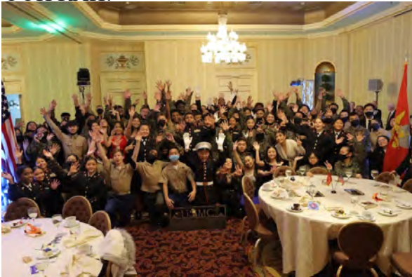
Como Cadets enjoy Marine Corps birthday at St. Paul Hotel

The Como Park MCJROTC cadets volunteered at the 2021 Minnesota State Fair for seven days helping the State Fair Sanitation Department keep the entire grounds clean and orderly. Roughly 35 cadets per day pushed and pulled trash carts, emptied 55-gallon trash cans, and picked trash and garbage from the grounds. The Como Park MCJROTC cadets have a twenty-year proud relationship with the Minnesota State Fair keeping it spotless for the many patrons who pass through its gates. They will never quit or give up their loyalty to themselves or the State Fair mission. Semper fi.