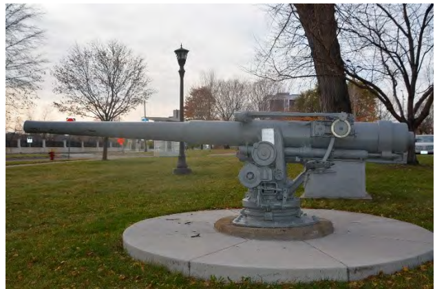
The gun mount from USS Ward (DD-139) that fired the first shots of World War II, sinking a Japanese mini-sub outside the entrance to Pearl Harbor on December 7, 1941.

Service academy nomination interviews for Minnesota's congressional delegation are now completed. The interviews took place between early November and mid-December. Those candidates receiving nominations to the U.S. service academies will be notified of their nominations by the nominating congressional office.