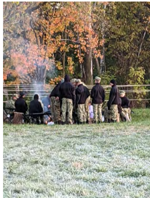
Polaris Battalion camp out

Cadets cooked lunch over the fire and a culinary team was deployed to cook the rest of the meals. An obstacle course was set up and ran, trails were used to complete a capture the flag type mission. This has been the first time in 4 years we have been able to have this camp out and the cadets loved it.