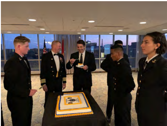
Joint Navy/Marine Corps Birthday

From the midshipmen, staff, and officers of Naval ROTC Minnesota, Merry Christmas and Happy New Year!