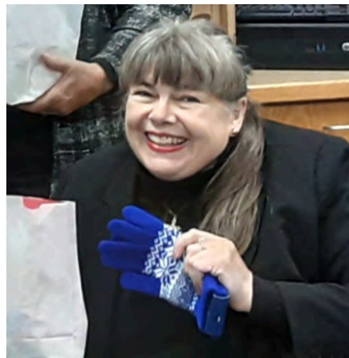
Delivering gloves and other supplies to MACV