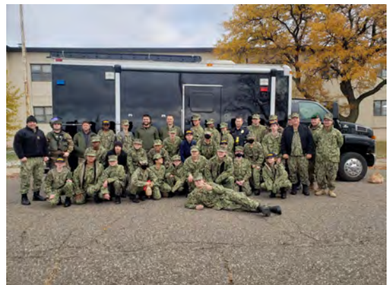
Twin Cities Squadron