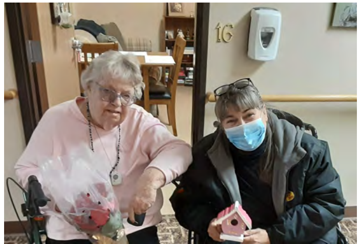
Delivering Poinsettias to Veterans Home

The Minnesota Council on Disability 2022 Virtual Legislative Forum, sponsored by the Minnesota Council on Disability, will be January 13th. This is an opportunity for the disability community to share what they want the Legislature to accomplish in this session. It is also an opportunity for legislators to share how they plan to promote this legislative agenda. Joyce will be addressing issues of Disabled American Veterans. The Governor and Lt. Governor will be giving opening remarks and the Speaker of the House and Senate Majority Leader will also be speaking.