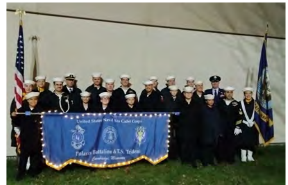
Polaris Battalion participate in Snowflake parade