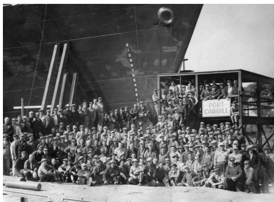
Port Cargill Shipbuilding Workforce

Did you know, Cargill built ships for the U.S. Navy in Minnesota during WWII?